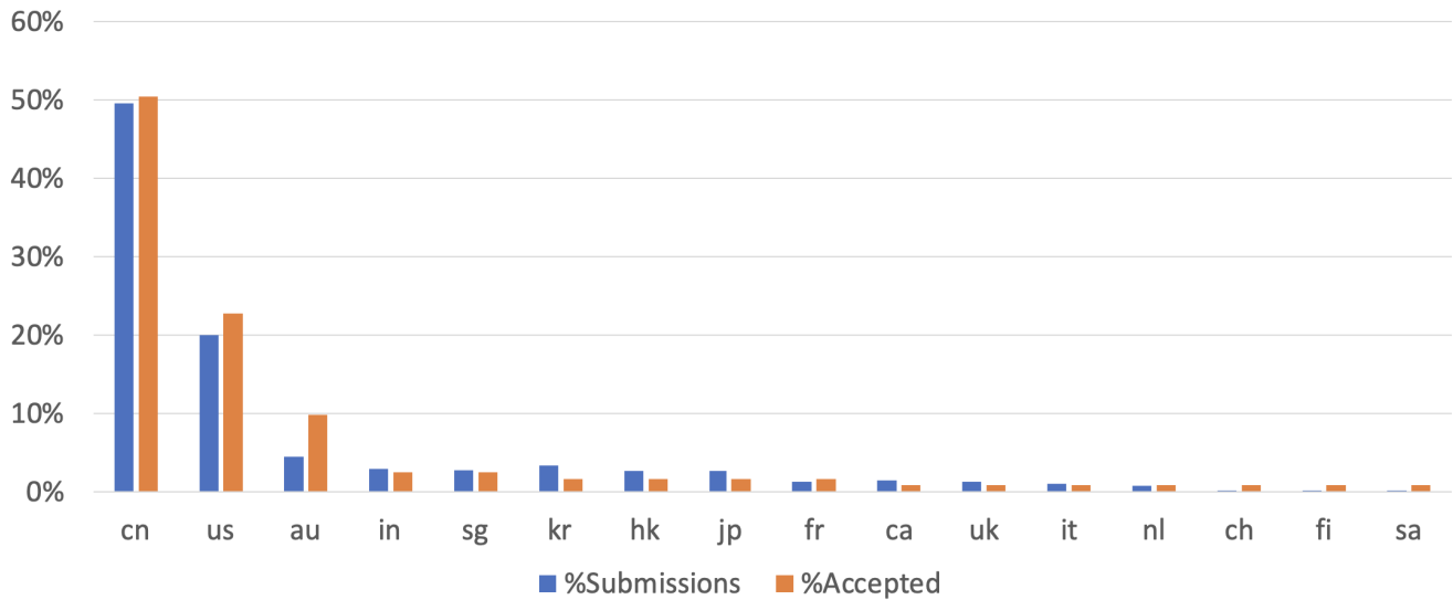
Figure 1. Geographic Distribution of Submissions and Acceptances

technical program followed the tradition of WSDM of primarily single-track presentations. Each main day was opened with a keynote talk by a renowned speaker: