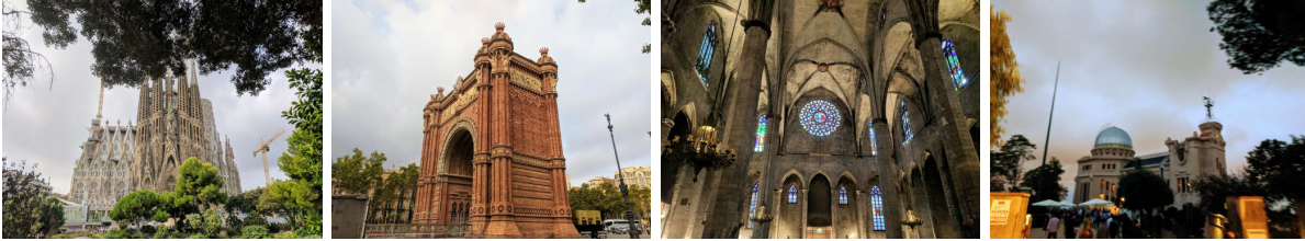
Figure 1: Sagrada Família, The Arc de Triomf, Santa Maria del Mar (inside), Fabra Observatory.