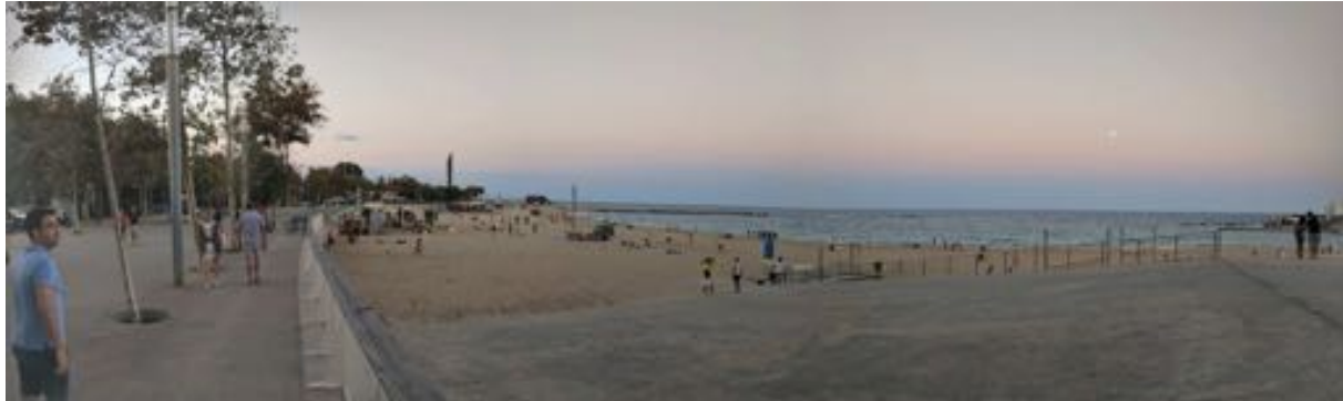
Figure 3: Setting for the welcome reception at Nova Icaria Beach.