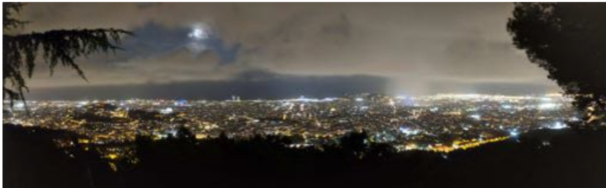
Figure 4: View of Barcelona from the Fabra Observatory.