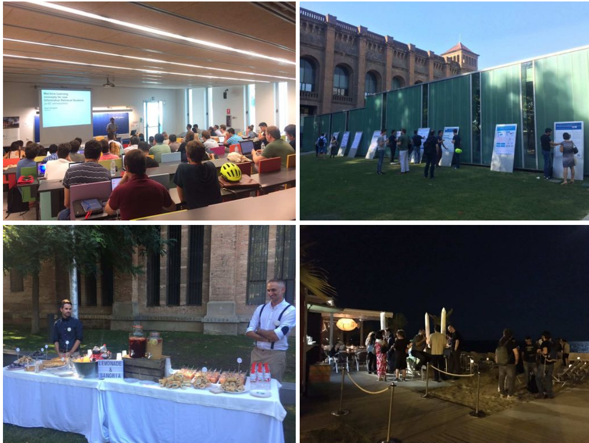
Figure 5: Moments from ESSIR 2017.

opportunities let the attendees relax and enjoy the beautiful setting of Barcelona. The social programme provided by the summer school included: