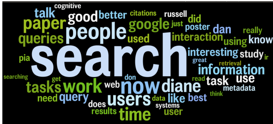
Figure 1: Word cloud of tweets during IiX'12 (both #iix2012 and #eurohcir).

During IiX'12 there was quite some activity in the social media, and in particular on Twitter. We tracked all the messages containing the conference hashtag #iix2012, that mention the user @iix2012, and the messages about the EuroHCIR workshop containing the hashtag #eurohcir. This leads to the following statistics: 1,219 tweets were sent, by 71 distinct users, 574 (47%) of the tweets were retweets, and 167 (14%) of the tweets contain links. The shared links contain mostly pictures of the conference, links to presentations, papers and project home pages.